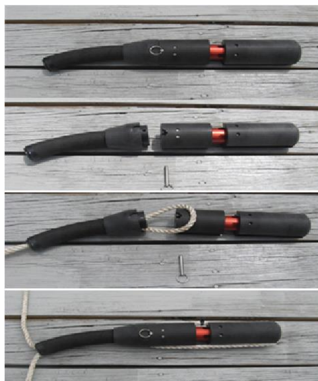
Figure 1. Four-step rigging of the Time Tension Line Cutter with buoy line (3/8 inch diameter).

TTLCs fitted for 3/8 to 7/16 inch diameter line cost $140 USD; from 1/2 to 3/4 inch line ~$300-400 USD; price not yet fixed on larger units.