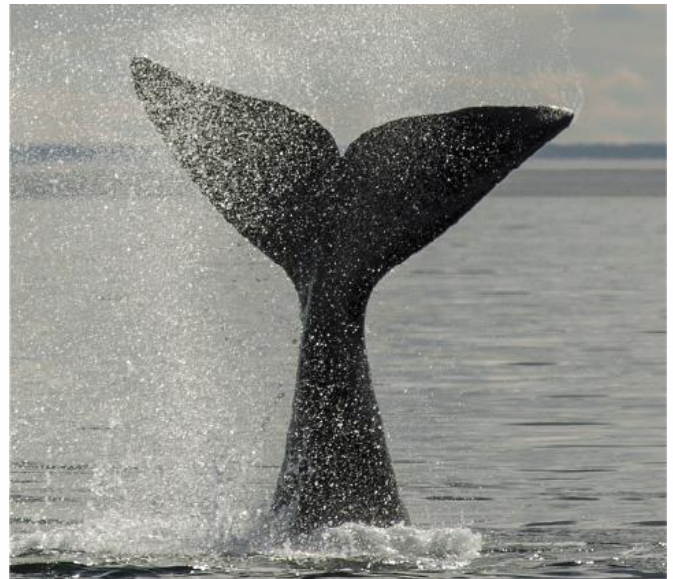
Figure 2. North Atlantic Right Whale

This series of handouts provides information about gear modifications that are expected to lessen the severity of whale entanglement in fishing gear, by lowering the breaking strength of conventional vertical line to below 1,700 lb without compromising crew safety or adding to gear loss. Successful methods are expected to vary by fishery. These modifications do not prevent entanglement, rather they increase the likelihood of entangled whales freeing themselves, thus enhancing their feeding success, growth, reproduction and chances of survival. The series may grow as additional methods are developed and refined. Methods developed to date result from the ingenuity of fishers, supportive industries, and entrepreneurs. The Government of Canada is not promoting or endorsing any of these products or methods, but is sharing the information to support fishers' exploration of options.